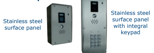
Stainless steel surface panel