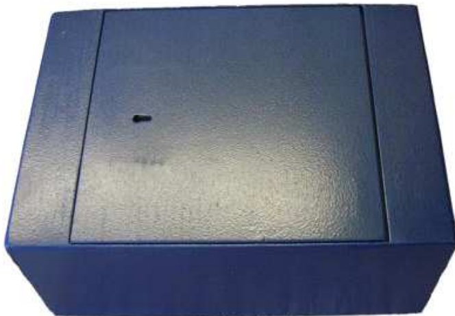
Stronghold MOT Extra Wide Cupboard Safe